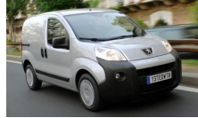
2019 PEUGEOT PARTNER