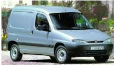
2008 PEUGEOT EXPERT